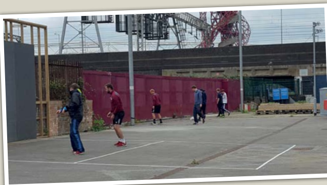
Wallball, just a stone's throw from the Olympic Stadium

West Ham United Foundation aims to break down barriers to sports access both for football and for other sports. FRE Flyers is a group of young hockey players who want to help the community.