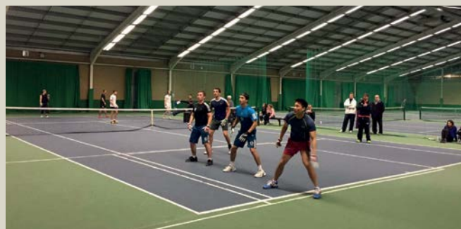
Men's doubles final action from the UK Nationals