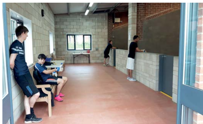
The newly enclosed Derby Moor courts