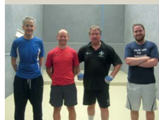
ABOVE The Cambridge Chroniclers on their home courts