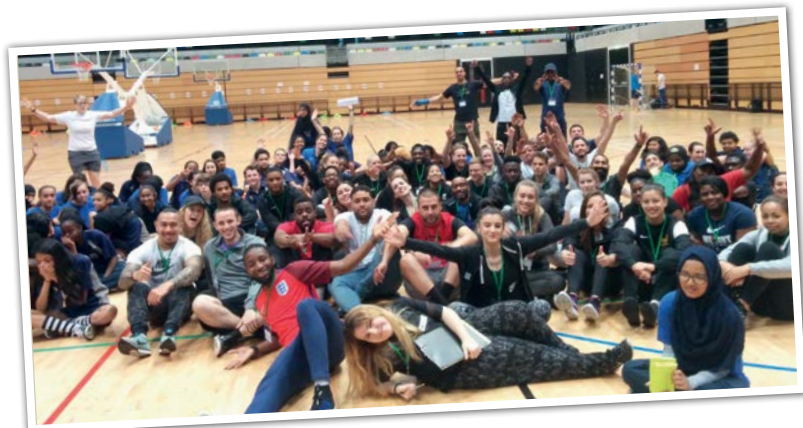
LEFT Youngsters at the Newham SportInspired games