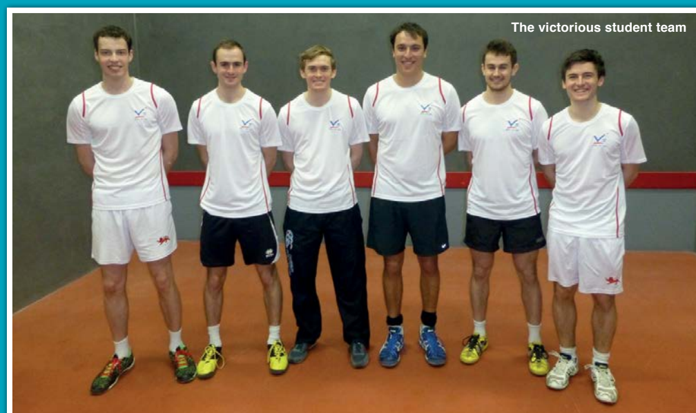
The victorious student team